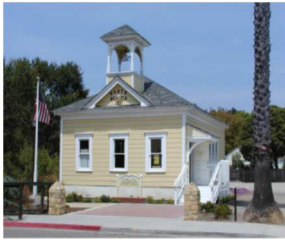
SANTA MANUELA SCHOOLHOUSE