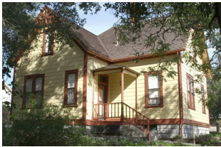
PAULDING HISTORY HOUSE