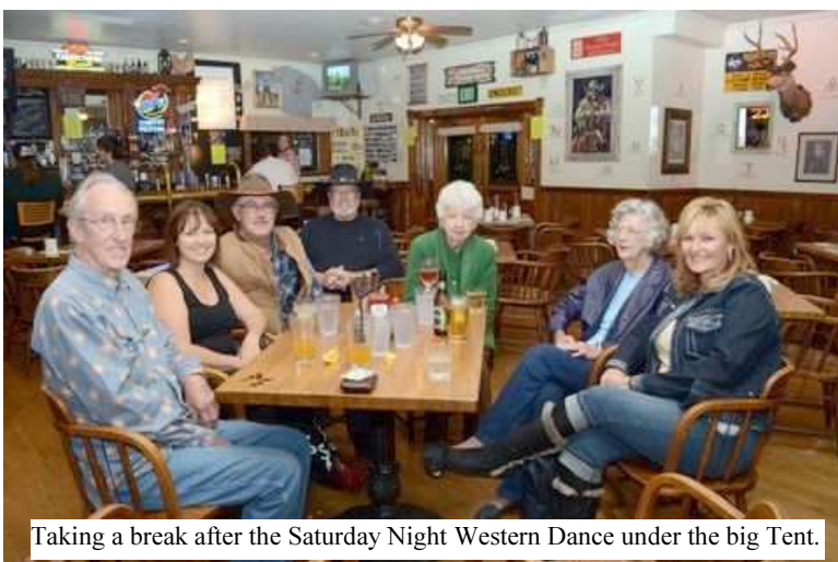
Taking a break after the Saturday Night Western Dance under the big Tent.