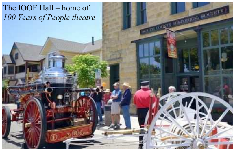
The IOOF Hall – home of 100 Years of People theatre