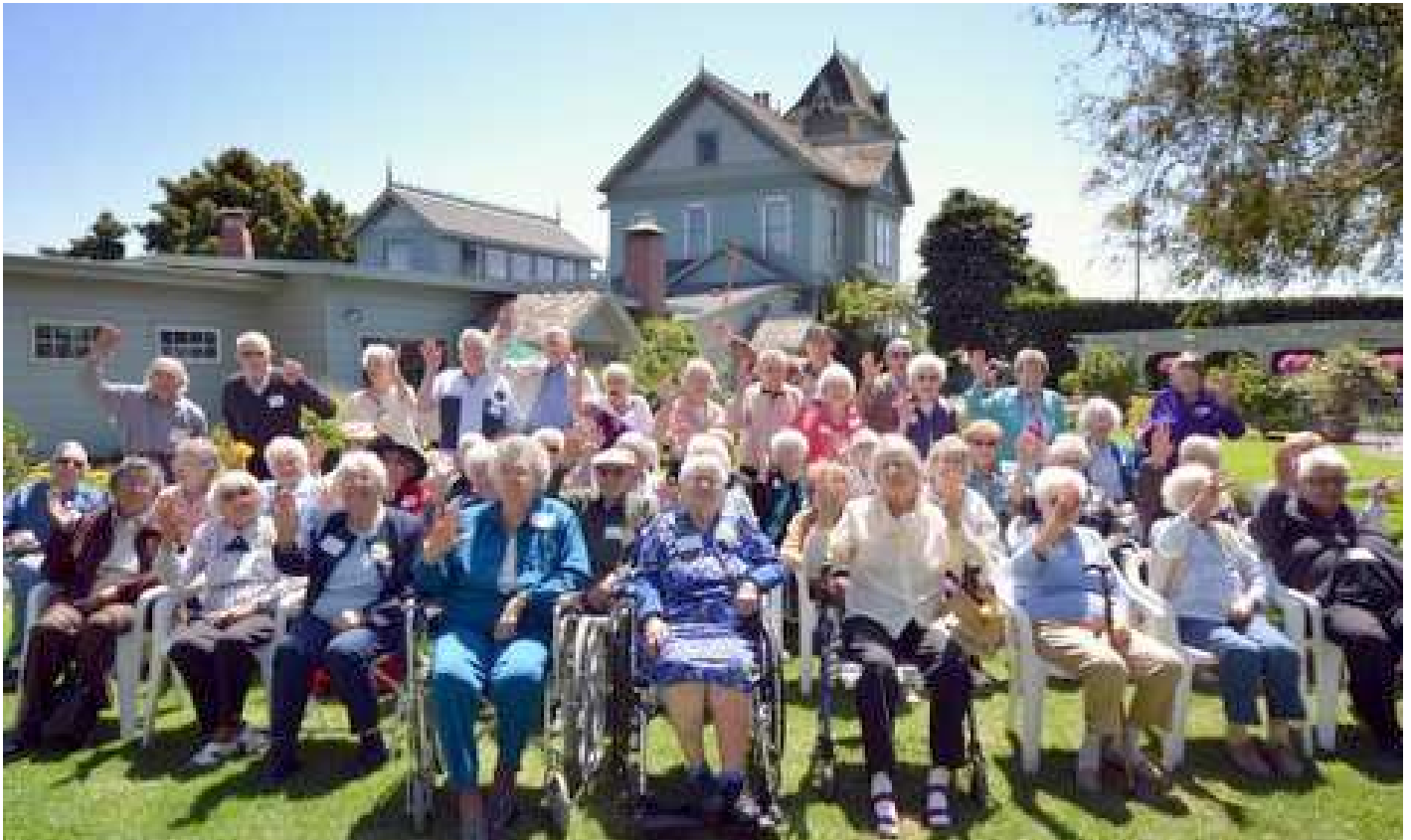
Nonagenarian Birthday Party at the Pitkin Conrow Estate. Can you pick out our Society Members?

We dedicated the new Centennial park, we honored our Nonagenarians, and we even got a new city song. And as the saying goes, a picture tells a 1000 words, so I'll end with a few photos from our Centennial events to speak for themselves!