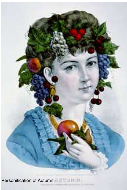
Personification of Autumn AUTUMN

Association with the transition from warm to cold weather, and its related status as the season of the primary harvest, has dominated its themes and popular images. In Western cultures, personifications of autumn are usually pretty, well-fed females adorned with fruits, vegetables and grains that ripen at this time. Most ancient cultures featured autumnal celebrations of the harvest, often the most important on their calendars. Still extant echoes of these celebrations are found in the mid-autumn Thanksgiving holiday of the United States and Canada, and the Jewish Sukkot holiday with its roots as a full-moon harvest festival of "tabernacles" (huts wherein the harvest was processed and which later gained religious significance). There are also the many North American Indian festivals tied to harvest of autumnally ripe foods gathered in the wild, the Chinese Mid-Autumn or Moon festival, and many others. The predominant mood of these autumnal celebrations is a gladness for the fruits of the earth mixed with a certain melancholy linked to the imminent arrival of harsh weather. wikipedia.org/wiki/Autumn